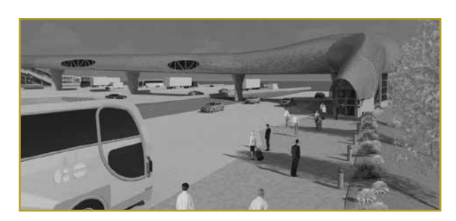
Figure 5: Design of Iconic Pickering Pedestrian Bridge vs. Bridge as Actually Constructed Source of data: Metrolinx

Artist's Rendering of North Plaza of the Pickering Pedestrian Bridge, showing special cladding design, which should have been built by 2013.